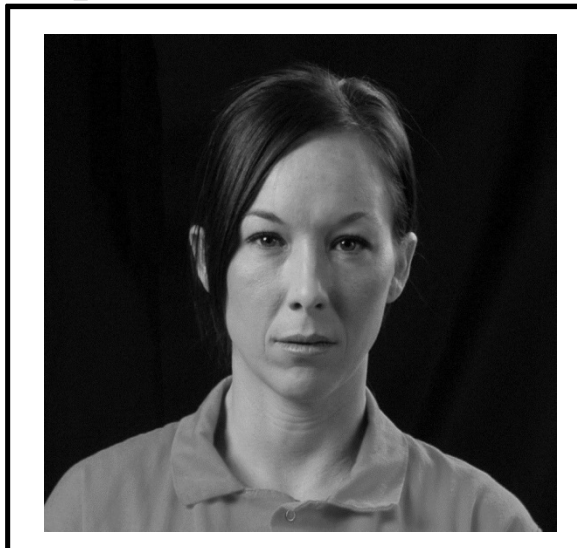
"Reporting protects us all"