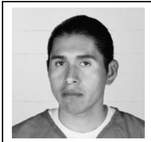
"Sexual abuse is never your fault"